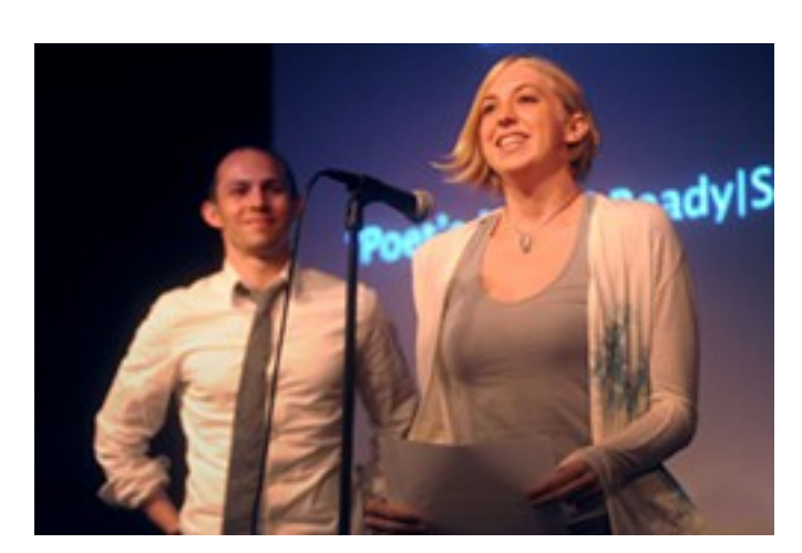
"Poet's Love," Ready|Set|Go!

The idea that you get slower as you get older seemed in full force as the Austin Critics Table marked its 20th year of presenting annual awards for outstanding achievements in the arts on Monday, June 4. The ceremony at Cap City Comedy Club crept along like a senior citizen in the passing lane, taking more than three hours to hand out honors in 47 categories and welcome five new members into the Austin Arts Hall of Fame; all this despite the best efforts of the arts writers at the mic and house band the Invincible Czars to move things along – and even the introduction of a drinking game to keep spirits high.