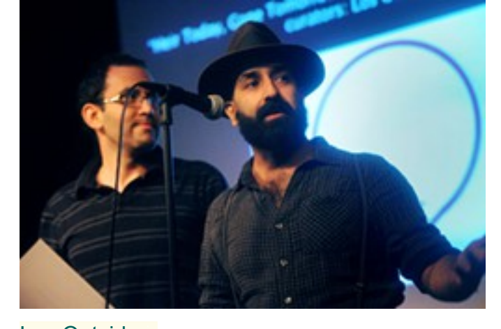
Los Outsiders