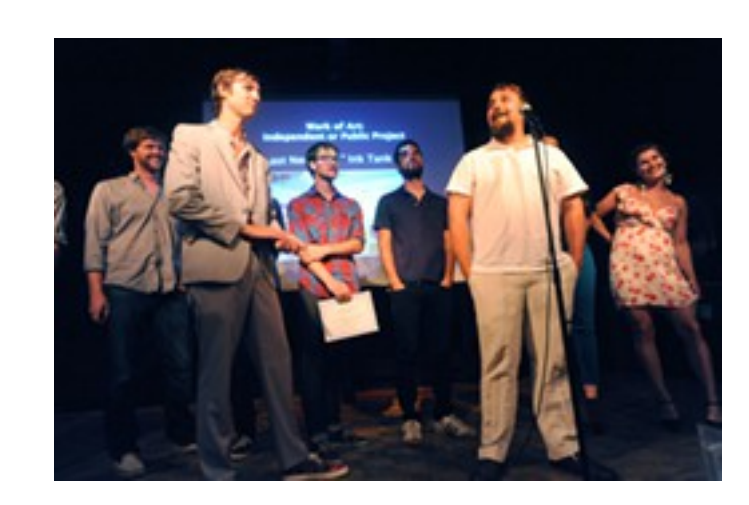
Ink Tank Lab